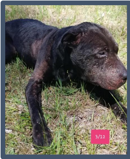
Okee when she was found on 3/12/19 at Okefenokee Swamp. She was swollen from bites, lacerations, and punctures.

Bites, punctures, scrapes, and lacerations covered her entire face, neck, shoulders and legs. We wasted no time in scheduling her a vet appointment for an examination and treatment plan. Thankfully all this little girl needed was some powerful medication, time and love. We named her "Squishy" while in our care and she quickly healed! The campers who found her were committed to her and weeks later drove back down from Pennsylvania to adopt her! Her new name is Okee Ravioli and her family continues to be committed to her well-being. We're unsure about Okee's previous life, but it seems as though she hasn't had the most positive interactions with other dogs. As a result, Okee was dog reactive and was unable to be around other dogs. The family has invested in training and obedience classes for this girl and she is making great progress! We love these kinds of stories! "Saving one dog will not change the world, but surely for that one dog, the world will change forever." Because of this couple's compassion and desire to help this defenseless dog, Okee's life has completely changed forever.